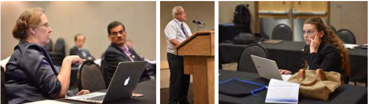
Participants and Presenters at today's FAO Sessions and ICID Meetings.

The various working groups of ICID also met today to discuss the strategic sub-themes of On-Farm, Basins, Knowledge, Schemes. A meeting of the Permanent Committee on Strategy and Organization (PCSO) was also held. The PCSO is responsible for increasing the number of member countries and assisting the National Committees to become more active in their own countries to achieve the goals set for them from time to time by the Council.