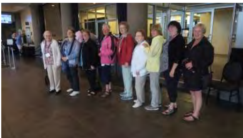
Participants in the Accompanying Persons Program had fun today at the Western Development Museum.

Several tours have been organized for accompanying persons over the past few days. Today, nine individuals visited the Saskatchewan Western Development Museum.