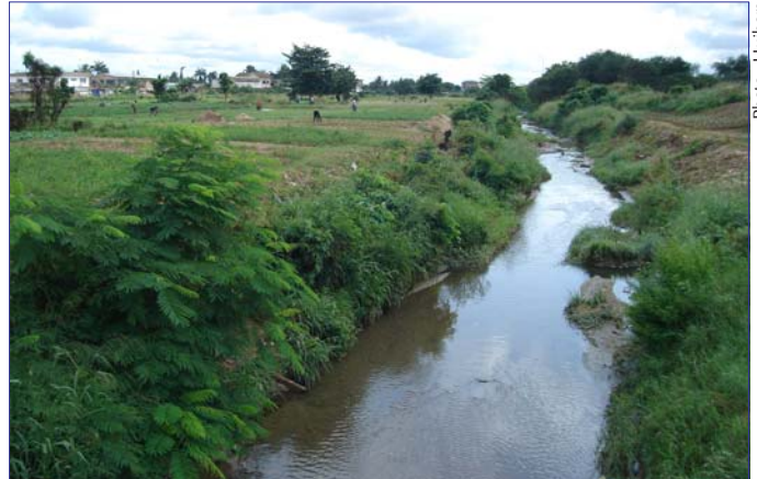
Wastewater use for vegetable fields in Accra, Ghana

Wastewater can mean different things to different people with a large number of definitions in use. However, it can be defined as "a combination of one or more of: domestic effluent consisting of black water (excreta, urine and faecal sludge) and grey water (kitchen and bathing wastewater); water from commercial establishments and institutions, including hospitals; industrial effluent, storm water and other urban run-off; agricultural, horticultural and aquaculture effluent, either dissolved or as suspended matter (source: Sick Water, UNEP, 2010).