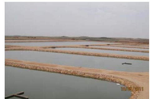
Figure 3. Stabilization Ponds System

Stabilization Ponds (Fig. 3) treatment is often very cost-effective in reducing discharge levies combined with the production of reusable energy in the form of biogas. Pay-back period of in anaerobic treatment technologies can be as low as two years. Anaerobic treatment of domestic wastewater can also be very interesting and cost-effective in countries where the priority in discharge control is the removal of organic pollutants.