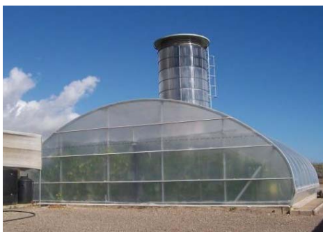
Figure 1. Closed greenhouse prototype of the Greenhouse Watery project in Almeria, Spain

Greenhouse horticulture in Morocco occupies around 25,000 ha and generates more than 1 million permanent jobs in the greater area of Agadir. It is able to export food crops mainly to Europe and contribute to significant source of revenue. The new generation greenhouse reduces the total water consumption of crops by 60% compared to standard greenhouse (Fig. 1). This can be achieved either by condensing the water evaporated by plants or by specific evaporation pad, fed with saline water or treated wastewater or by a combination of both water sources.