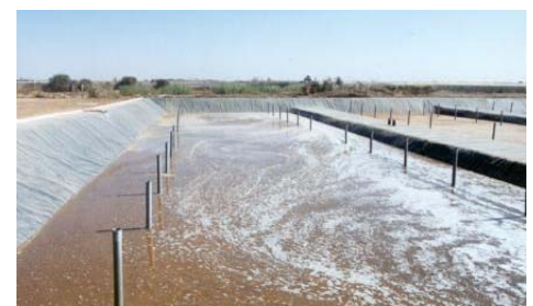
Figure 4. Sand Filter System

Sand filtration (Fig. 4) is one of the oldest known wastewater treatment technologies. If properly designed, constructed, operated, and maintained, it produces a very high quality effluent. Sand filters are beds of granular material, or sand, drained from underneath so that pretreated wastewater can be treated, collected, and distributed to the land application system. Dr. Redouane Choukr-Allah can be contacted at <redouane53@yahoo.fr>