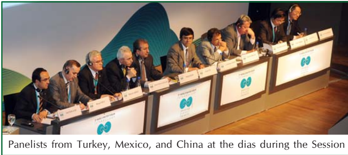
Panelists from Turkey, Mexico, and China at the dias during the Session