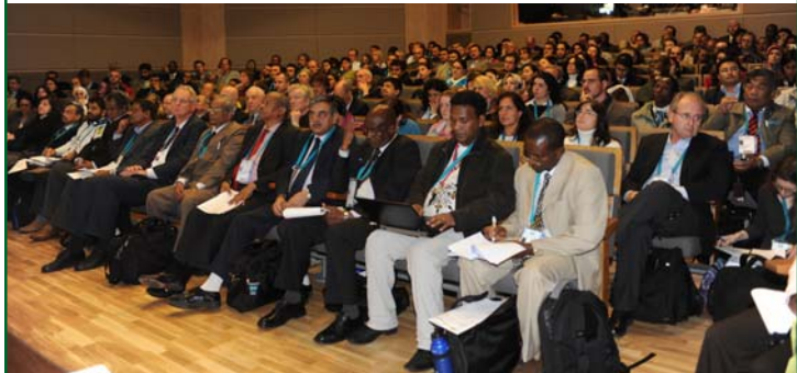
Delegates at the Session 2.3.4