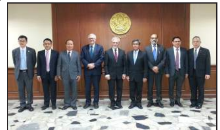
Members of ISC for WIF2

organization of WIF1 in order to bring all the members of the National Organizing Committee (NOC) NC at the same level of understanding for the smooth and successful organization of WIF2. Various Working Groups established by the Host National Committee such as Technical Matters, Security, Reception and Transportation, Information Technology etc. made brief presentations on the facilities available and the arrangements already made. The points included for discussion were: Logistic arrangements including venue, transportation, hotel accommodation; Update on technical matters; Coordination with international partners; Ministerial Roundtable;