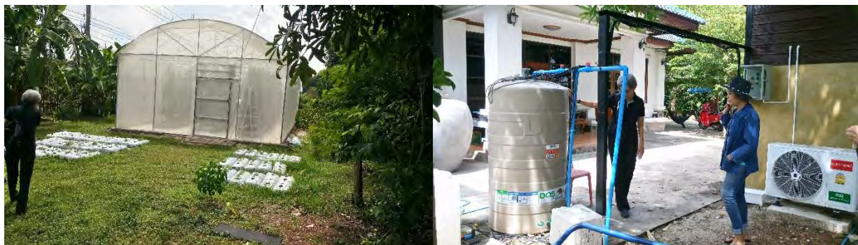
Fig.3 Modernization and greenhouse for a young smart farm water and fertilizer tanks, as for dripping irrigation systems in Ms.Duangrudi farm [1]