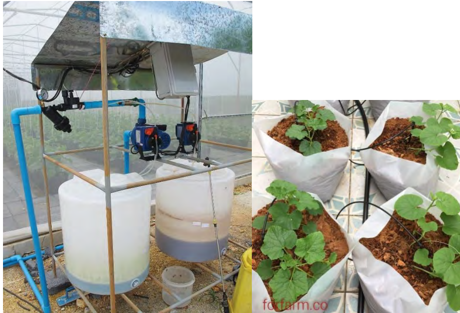
Fig.4 Modified conventional melon farm water and fertilizer tanks, as for dripping irrigation systems [10]

20-10-30 to strengthen the stalk together with fertilizer 7-1-40 to a beautiful color. Then until full maturity (45-55 days), give full water and fertilize the foliar spray to develop sweetness with 0-0-50 formula. After given fruits, the melon will be harvested to gradually reduce the rate of water and harvesting for consumer supply in the market.