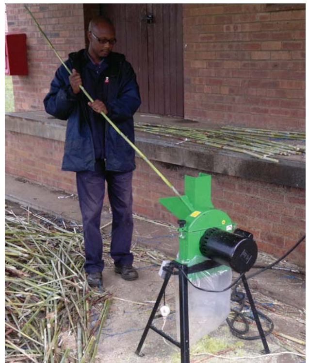
Grinding of sweet sorghum stems as part of the biofuels study.

This is now being followed by the implementation phase, where the WRC is funding an additional five-year study (2015-2020). This project considers the economics of feedstock production by smallholder farmers, as well as developing guidelines to advise emerging farmers on agronomic practices of feedstock cultivation. It focuses on two feedstocks in particular, namely grain sorghum and soybean, selected by the DoE as reference feedstocks to determine the pricing framework for bioethanol and biodiesel production.