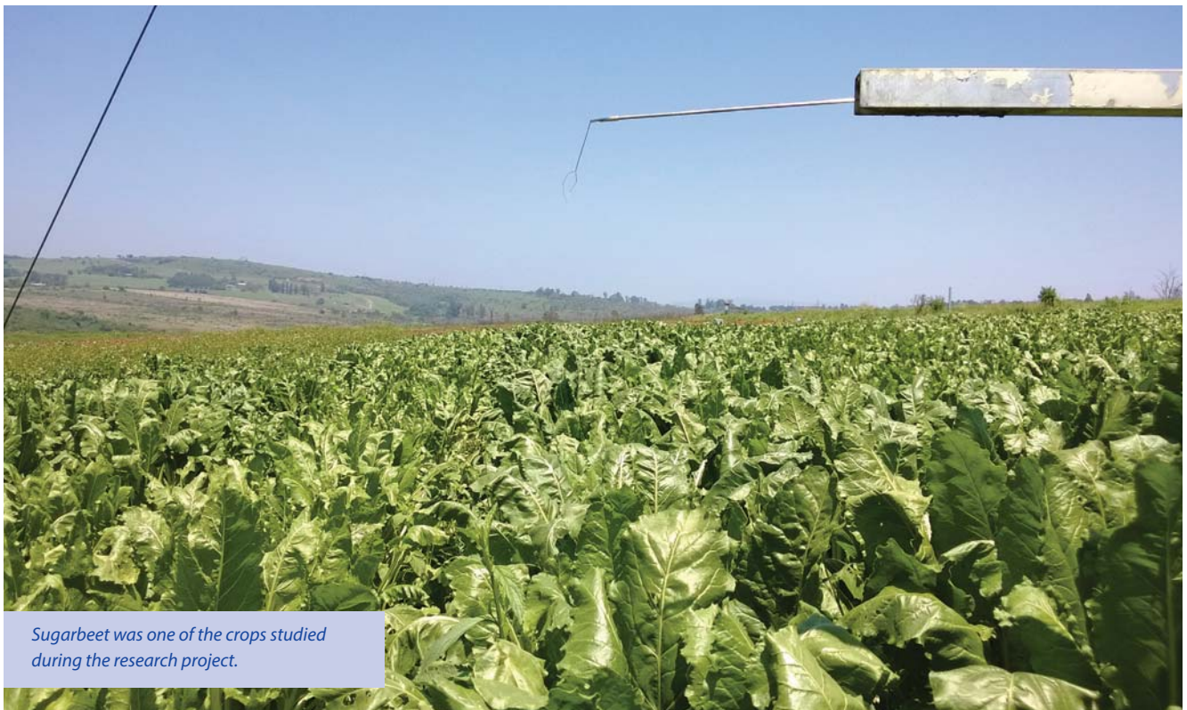
Sugarbeet was one of the crops studied during the research project.

bioethanol and biodiesel crops. During the third phase of research, attention is now being given to water use and related agronomic practises with budgets of income and expenditure per hectare for advising emerging farmers who are interested in including these crops in farming operations.