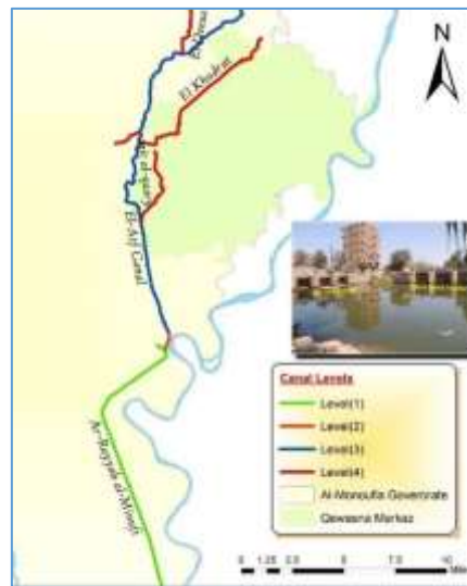
Figure 2. Schematic drawing for El-Atf canal with a photo for its head regulator.