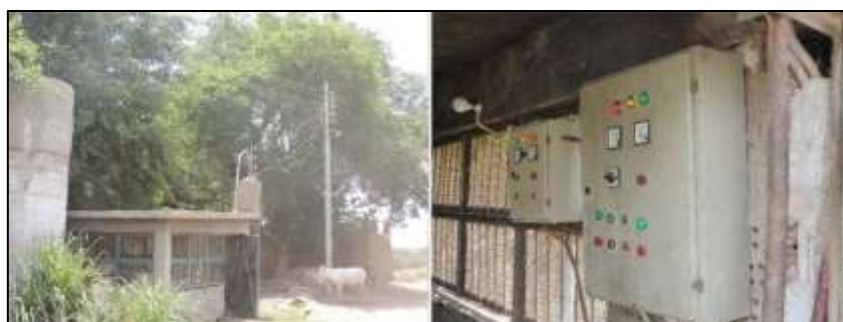
Figure 4. The connection of Mesqas (18/16) to the electricity and the electric plates inside the Mesqa (Figure 4 is not necessary and may be deleted)

were not connected to the improved Mesqas, and who were depending on shallow groundwater, was ~ 6500 L.E./ha/year. The actual difference between total costs of diesel and electric pumps might be less than this example because there are common items that have the same costs in both systems like operator wages, and the maintenance of other items (like valves, etc.)