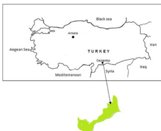
Figure 1. The location of Kayacık irrigation area in Turkey.